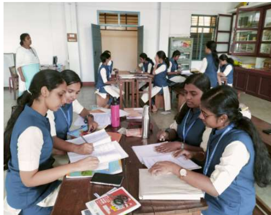
Photo of Workshop in lesson plan preparation

The week-long workshop focused on equipping participants with skills for effective lesson plan development is conducted annually in the institution. Usually in the initial sessions of BEd program Teacher educators cover theoretical foundations, content analysis, and unit structuring. Students, guided by educators, create five units and lesson plans for 45-minute classes. Small group sessions on Day 3 allow hands-on support in lesson plan development. Days 4 and 5 involve active student engagement in creating plans, with educators providing guidance and feedback. The collaborative approach during presentations showcased a commitment to refining lesson plans for optimal educational impact.